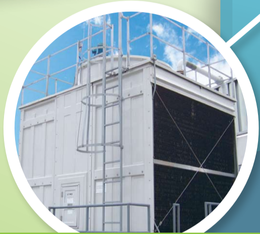
空調裝置 Air-conditioning installation