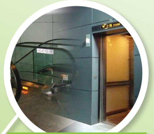
升降機及自動梯裝置 Lift & escalator installation