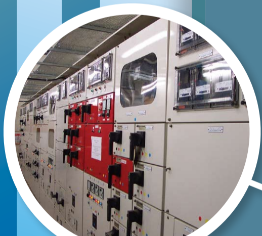
電力裝置 Electrical installation